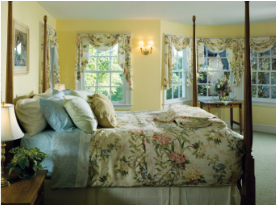
Top: The master bedroom exudes warmth and tranquility with pale yellow walls; a four-poster bed dressed in a yellow, green, blue and pink floral comforter; and window treatments to match the bed linens. The carpeting is sage green.