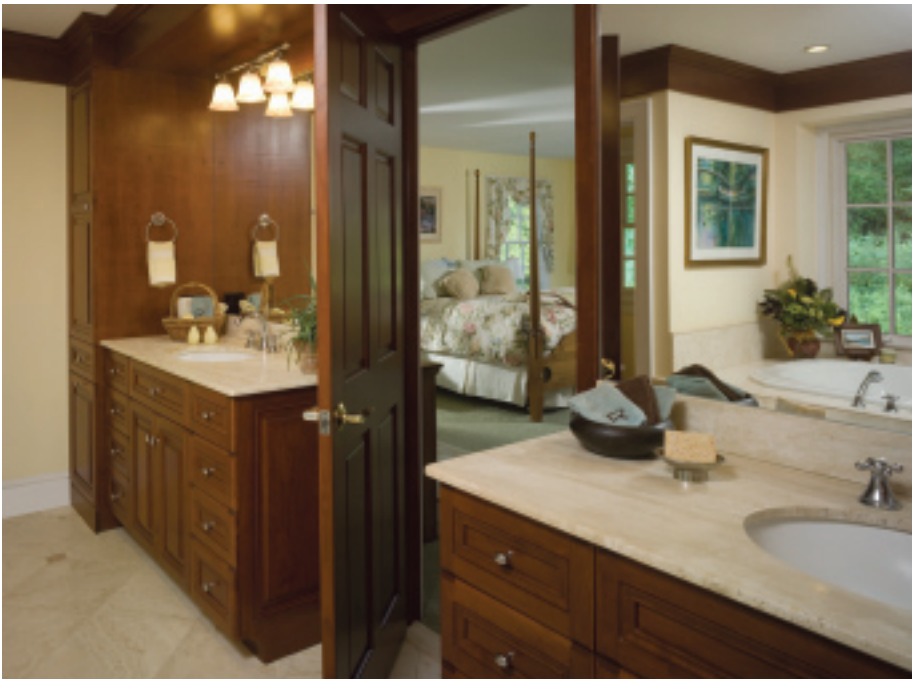
Below: The master bathroom features his and hers cherry vanities and molding. Ivory tile and the travertine floor contrast with the dark wood. There are views to the greenery outside from the large soaking tub.

admits. “Our familiarity with the construction made it much less scary for us.” In fact, “it was actually fun,” she adds. The couple packed up everything in the affected areas of each construction phase and stored it in a rented tractor-trailer on site. “There was one bout of rainy weather that, well, dampened our spirits. But other than that, it was just like Christmas every day—seeing something new,” she says. Once the home was completed, the Rochelles furnished it in an eclectic mix of traditional antique